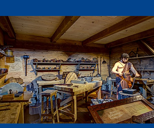
View from Inside the Ari Encounter